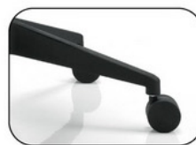
325H 尼龍耐織腳 (Winner-04) 325H Nylon Base (Winner-04)