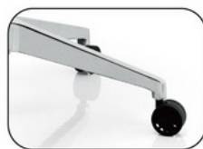
AL-343 鋁合金腳 (Winner-01 / 02) AL-343 Aluminum base (Winner-01 / 02)