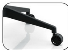
343H 尼龍耐織腳 (Winner-01 / 02) 343H Nylon Base (Winner-01 / 02)