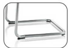
AXB 電鍍彎管腳 (Winner-06) AXB Chromed Sled Base (Winner-06)