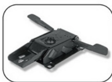
自載重底盤，連動式4段鎖定 (Winner-01 / 02) Weight Balancing Mechanism * Synchronise with 4 locked (Winner-01 / 02)